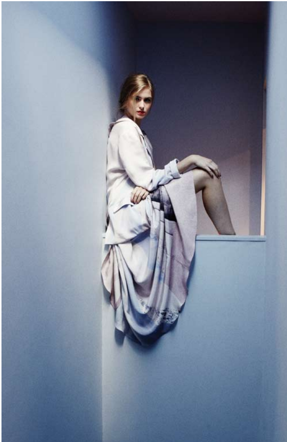
Teatum Jones “Sometimes It Snows In April” Spring Summer 2012