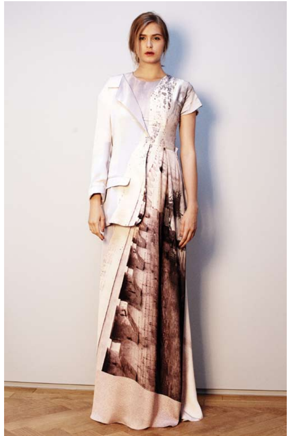
“The Liberty Dress” TJ/SS12/DRS004 — Escapist Placement Print Silk Heavy Crêpe de Chine with 100% Silk Lining